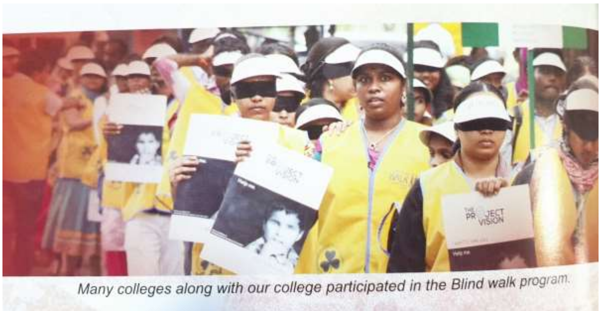
Many colleges along with our college participated in the Blind walk program.

Many participants were given mementos by the organizing NGO. Students were given certificates and blind walk jacket and blindfolded ribbon to all the participants.